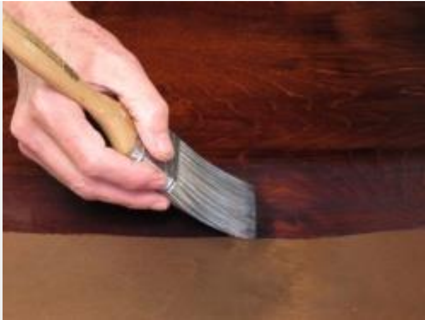
Water Soluble Dye Streaking

If you are brushing a water-based finish over a water-soluble dye, you should be aware that the finish can dissolve the dye and the brush will pick it up and cause streaks. To keep this from happening, seal the wood first with another finish that doesn't contain water—for example, shellac, varnish or lacquer.