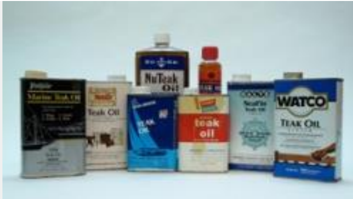
Types of Teak Oil

Brands of teak oil can be anything from simple mineral oil to thinned varnish to blends of linseed oil and varnish. Most are blends of linseed oil and varnish.