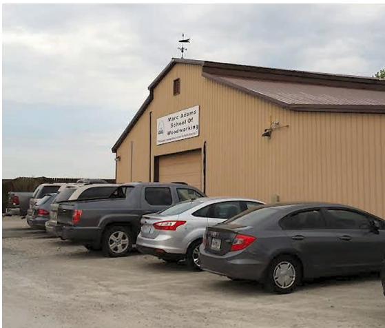
Marc Adams School