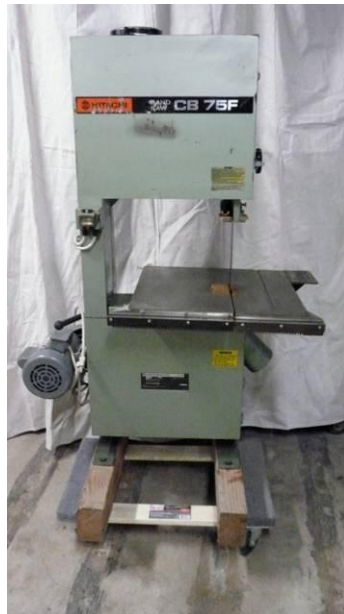
Re Saw, Hitachi CB75F: (new $3500)