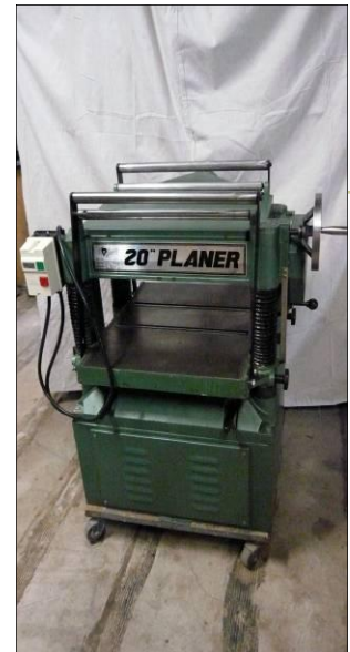
20" grizzly planer (new:$1500) $800

Call Howard Lund 312-519-4848 Or email info@metrichome.com